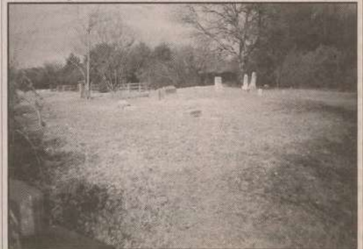
Moore Cemetery contains many graves of infants and children.