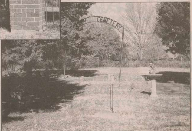
Between 35 and 50 persons are believed to be buried in Parrish Cemetery.