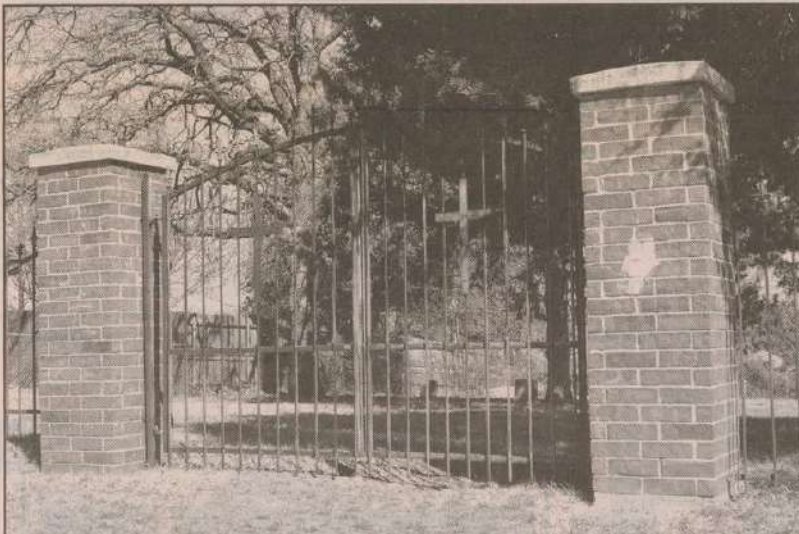
Above, Parrish Family Cemetery arch entrance

Additional burials have occurred but were not included in the records.