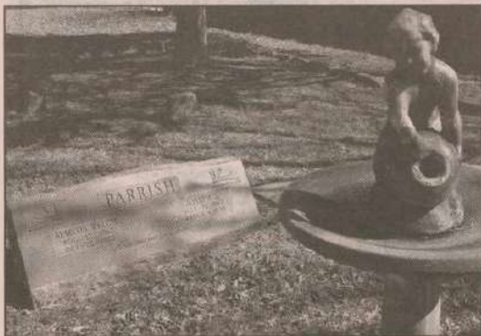
Parrish Family Cemetery headstone and statuary